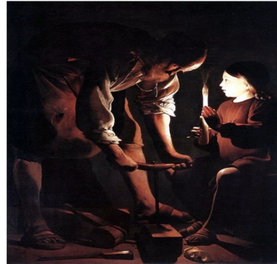
De La Tour