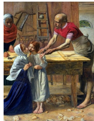
Millais - Christ in the Carpenters Shop

compare my own and others' ideas about what I and others wonder about how God is always with us, and realise that some questions are difficult to answer.