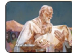
Abraham - The Father of all Nations