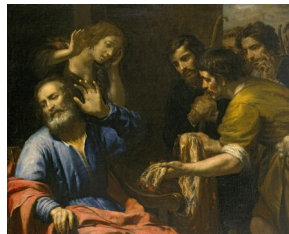
Joseph's Coat Brought to Jacob by Giovanni Andrea de Ferrari, c. 1640

Jacob had 12 sons: Reuben, Simeon, Levi, Judah, Issachar, Zebulon, Joseph, Benjamin, Dan, Naphtali, Gad and Asher